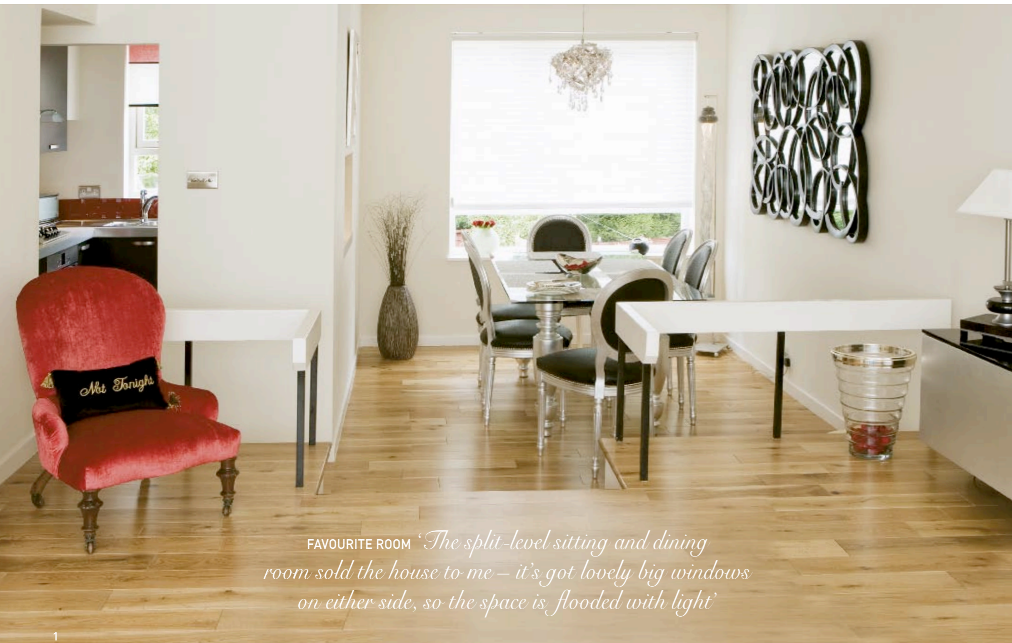
FAVOURITE ROOM 'The split-level sitting and dining room sold the house to me – it's got lovely big windows on either side, so the space is flooded with light'